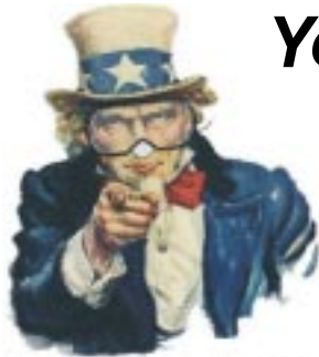
Your dive club wants You!

Yes, it's election time again, your favorite time of year. Not to worry, we have volunteers to fill almost every officer position. I say almost because we are missing one of the most important officers, the Entertainment Coordinator. This is the person that books the guest speaker for our monthly meetings. We have plenty of people to book we just don't have someone willing to step up and call these people and submit the information to the newsletter each month. How hard can that be?