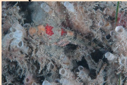
Sculpin camouflaged on rock